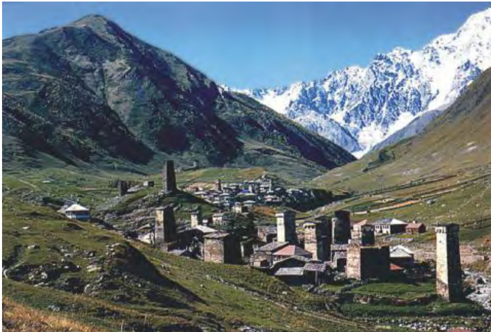
Ancient Svanetian Towers, X-XII century

Furthermore if Georgia becomes an energy-exporting country it does not ensure automatic energy security. Even if Georgia were to export huge amounts of electricity and, in the best case scenario, it would support to generate high levels of income for the state budget, the majority of the population would continue to live in poverty and have limited access to electricity.