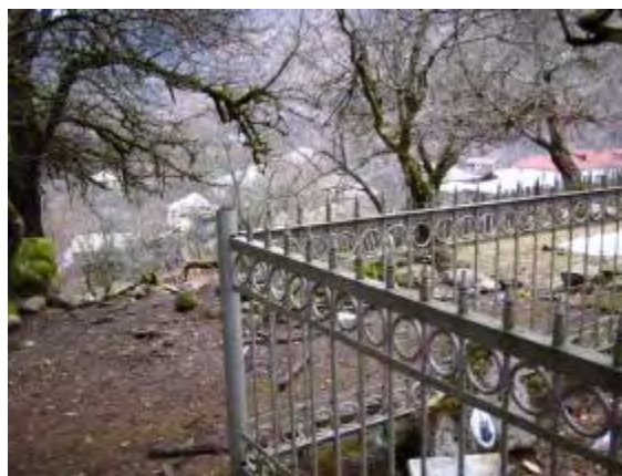
The cemetery that would be flooded

During the construction periods of the 1980s on the Enguri and Khudoni dams, Khaishi villagers witnessed vast corruption associated with the sale of project materials. The former prosecutor of the Mestia region, Isaak Kardava, noted large amounts of graft related to the sale of “construction materials from Enguri - bricks, timber and others; in all of Georgia, settlements and cities have been constructed [with these materials]”. Kardava speaks of huge violations during the construction of the Enguri and Khudoni dams during Soviet times. Around 200 people had been arrested for misuse of construction materials. However, at that time first secretary of the Communist Party of Georgia, Mjavanadze, stopped all trial cases.