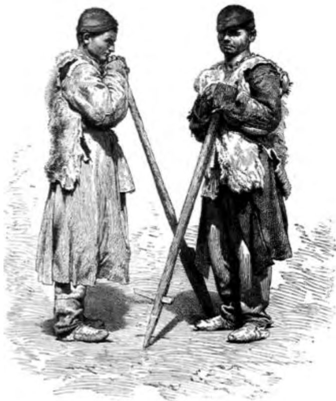
Svan Types, 1881

This report contends that the Khudoni dam is not a proper solution for the Georgian energy sector, through an analysis of the multifarious impacts of dam construction on ordinary people in the Georgian highlands. The report offers solutions by exploring alternatives and potentials for developing other sustainable energy resources.