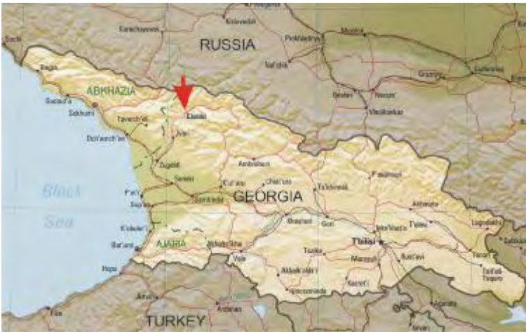
Map of Georgia. Location of the Khudoni dam

Georgia still faces problems in the energy sector related to energy generation, its distribution and access to and affordability of energy sources. Unfortunately, the country still lacks the strategic policies and action plans that would direct the country towards sustainable energy development, increased energy security and ensured access to energy. Current efforts to develop a Georgian energy policy are chaotic and far from sustainable.