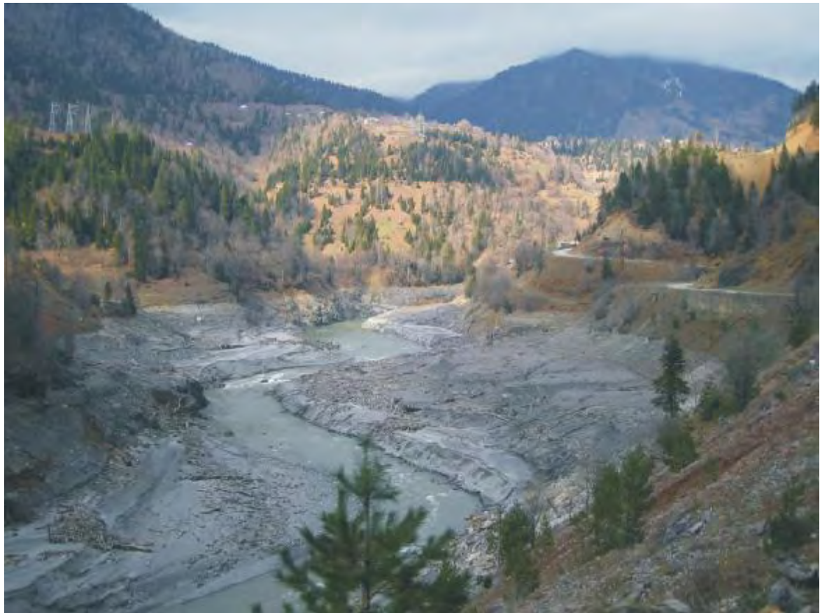
The Enguri gorge

To mitigate the potential impacts during the construction of Khudoni, a concrete piling wall and check dam were projected and constructed. However, despite these precautionary measures, the specialists predicted that the wall and check dam would be easily destroyed in the case of seismic activities 13 .