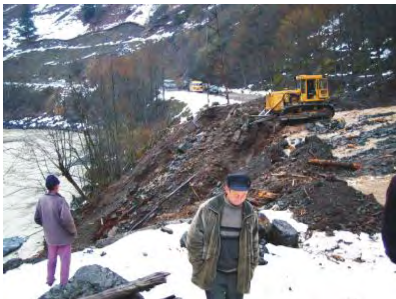
The landslide on the Khudoni site

Locals are very concerned. Tamaz Kvirikadze noted: “Despite the fact that millions have been already spent it would be impossible to construct the dam cheaper. The works that have been taken already need to be redone and it would be more difficult now. The construction already changed the environment around and mountains are starting to fall apart. Before construction there were no springs and waterfalls. Now there is water everywhere and once it would flood us all.” According to villager Oleg Jkadua: “There are some nuances that are impossible to restore. At least three years work would be needed to restore the site to the situation that construction could be continued.” And these problems are further compounded by the penetration of the ground, mountain and its slopes with water.