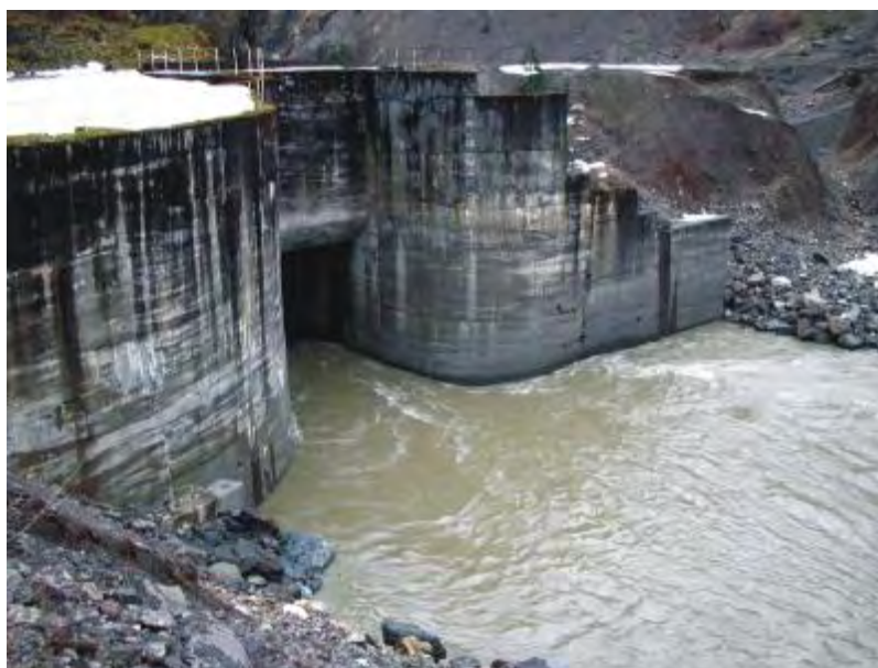
The Enguri river in irons

Although the rehabilitations require quite a considerable amount of funds, all the same the rehabilitations cost less than the construction of new dams. The rehabilitation of three units and significant works to ensure dam safety for Enguri HPP in 2006, increasing its actual capacity from 800 MW to 950 MW, cost up to EUR 50 million. It is expected that through additional 10-20 million euro investments the rehabilitation of Enguri Dam and an additional two other units will be undertaken. That gives the possibility to increase Enguri HPP's actual capacity towards a projected 1300 MW in 2008.