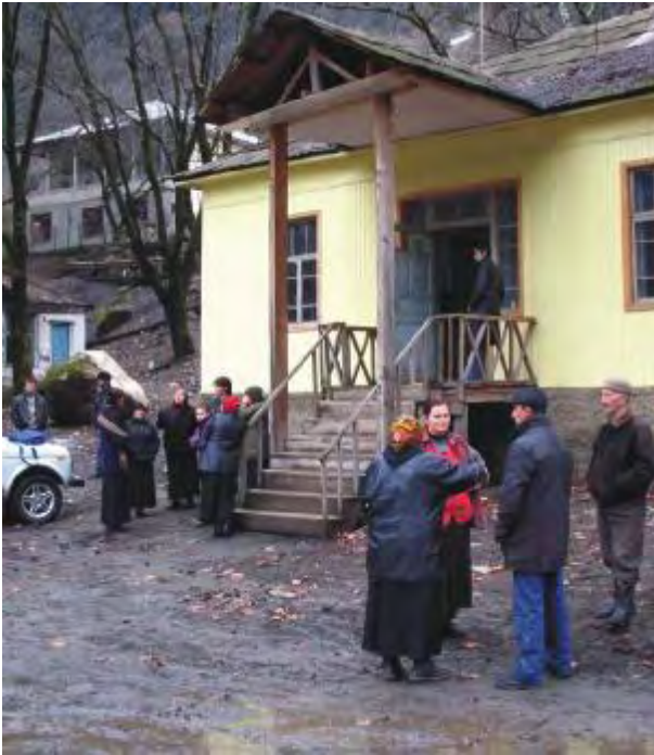
The concerned Khaishi villagers

If the Khudoni dam will increase the electricity tariff due to huge investments in the energy sector and is to become an economically viable project for internal use, it should be remembered that people living near the Enguri HPP, Georgia's largest hydro project that accounts for 40 percent of Georgia's electricity consumption, already experience problems with access to energy. High electricity tariffs are already unaffordable for a majority of the Georgian population; more than 50 percent of the population is living under the poverty line, while extreme poverty affects 17.4 percent of the population 45 . Khudoni's significant effects on the electricity tariff will further harm the livelihoods of a majority of Georgian people.