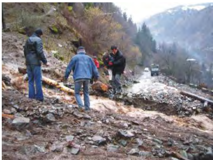
The landslide on the main road

The Khudoni HPP will intensify the devastation of forests and wildlife habitat, the loss of river species populations and the degradation of upstream catchments areas as a result of the flood-