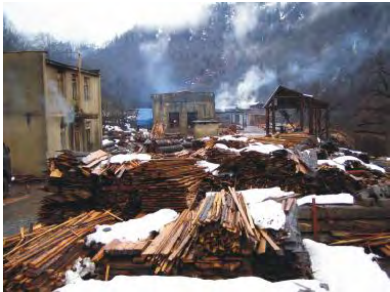
The saw-mill in former worker's camp

For visitors to Zemo Svaneti, it is evident that the region faces problems related to the sustainable use of its natural resources – unique flora and fauna, forests, and natural monuments. One problem contributing to resource degradation in the area is increased rural poverty, which has increased wood consumption for fuel, as well as illegal logging for export. Another problem is overgrazing and deforestation, which promotes increased soil degradation and erosion, significantly contributing to the frequency of natural disasters such as floods, landslides and avalanches that damage the environment and destroy economic infrastructure. And over the last decades, drastic climate change has noticeably impacted the surrounding environment. The trend goes towards increased temperature in Svaneti in comparison with the first half of XX century up to 0,90 C, with increased annual precipitation up to 14% and humidity rate 35 . The global warming process also negatively affects the glaciers, causing them to melt and retreat, and the further intensification of this process is expected that would lead towards the disappearance of small ones. 36