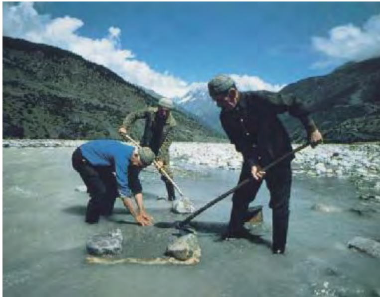
Svan gold panners using fleece 4

“Svaneti artistic creations of gold and bronze, copper and earthen wares, knitting and handicrafts give testament to its native ingenuity, encoding its myths of creation in folklore handed down from time immemorial, echoed in the plaintive strains of Svan music.